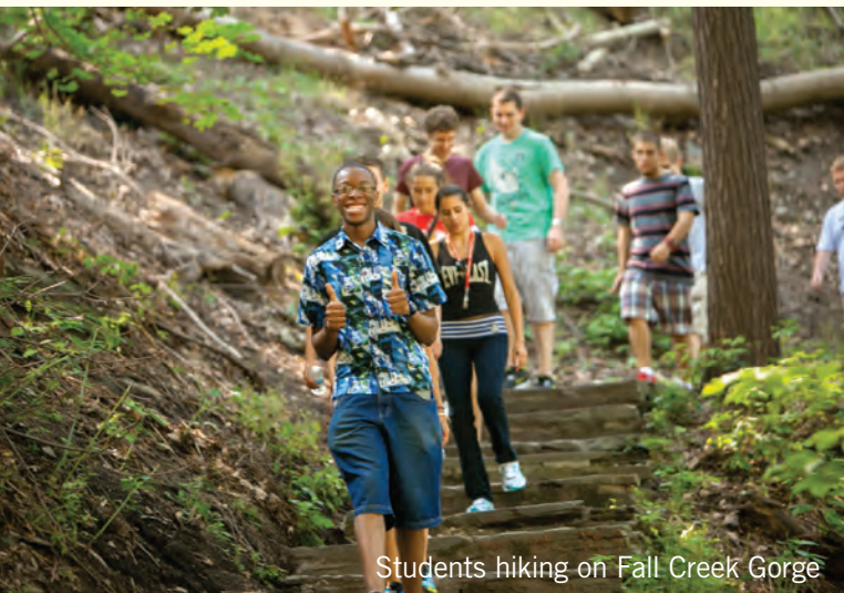
Students hiking on Fall Creek Gorge

Fall Creek and Cascadilla gorges and their trails are part of 3,400 acres of natural areas, both on-campus and throughout the region, managed by Cornell Plantations in support of Cornell's academic mission.