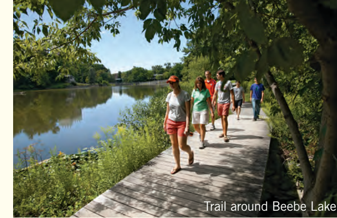
Trail around Beebe Lake