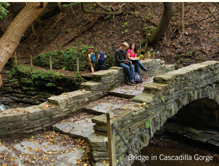
Bridge in Cascadilla Gorge