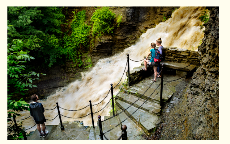
Eddy Dam Foot Bridge in Cascadilla Creek Gorge

Cover: College Avenue Stone Arch bridge over Cascadilla Creek.