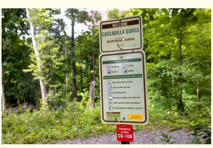
If you need emergency assistance in a gorge, call 911 and reference the letters and numbers on the closest red emergency locator sign to help first responders locate you.