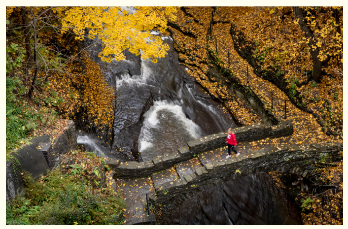
Cascadilla Gorge near Stewart Avenue

Tour Fall Creek Gorge, Cascadilla Gorge or around Beebe Lake with your mobile device. Download "Pocketsights Tour Guide" from the App Store or Google Play. Scroll to select your desired tour.